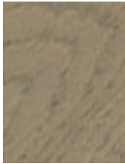
560 Weathered Oak