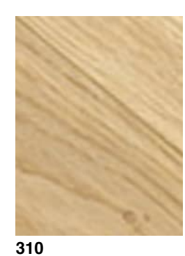
Natural Oak Brush