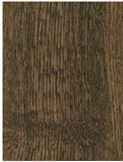
180 Coffee Oak