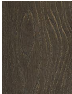
790 Cinder Oak