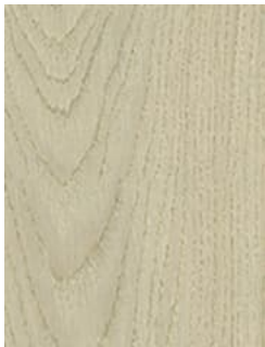
560 Weathered Oak