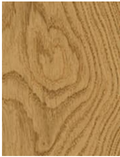
300 Natural Oak Smooth