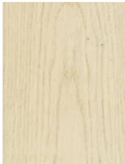
510 Coastal Oak