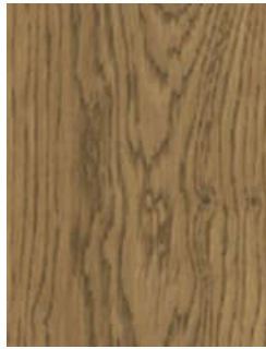
360 Rustic Oak