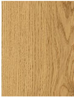
310 Natural Oak Brushed