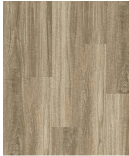
Seaside Spotted Gum